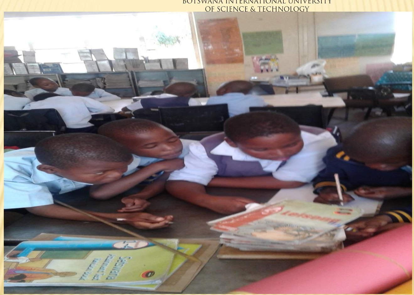
Recording a necessary science process