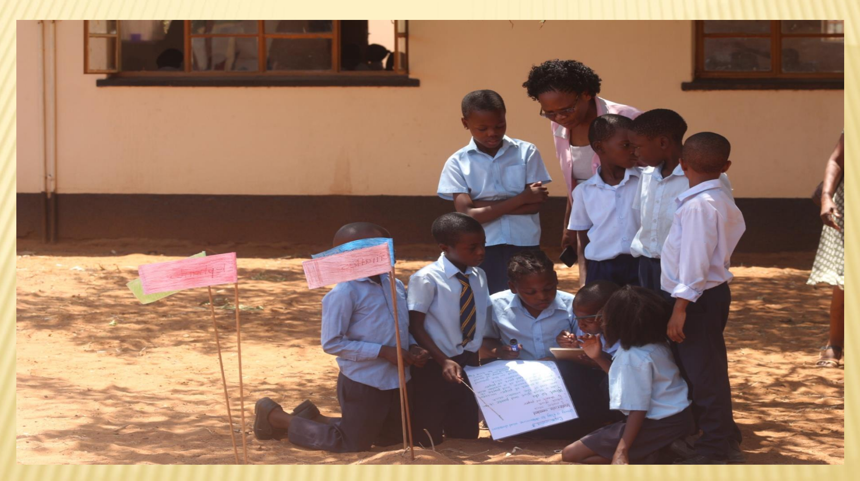
Investigating wind direction