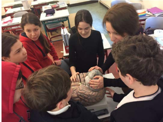
Figure 3. Children at brain model station at TED Istanbul College