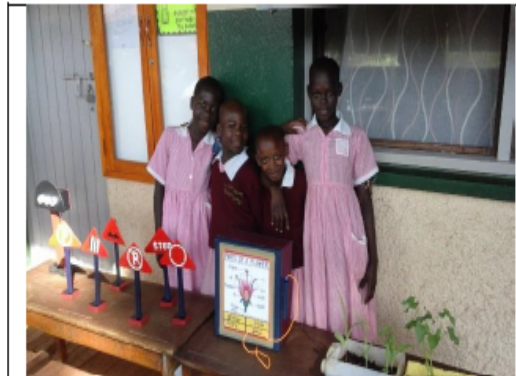
Children at Kiswa Primary School demonstrating road safety as well as plant reproduction.