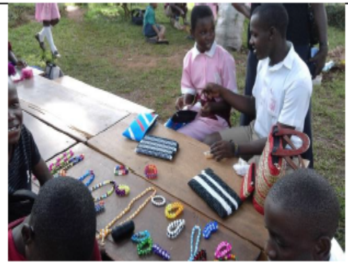
Showing off their projects completed during technology class – Kiswa Primary school