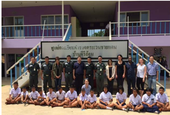
Global Young Academy 2017