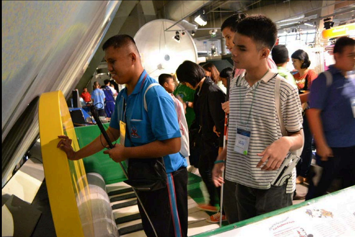
Activity @ Museum Exhibition