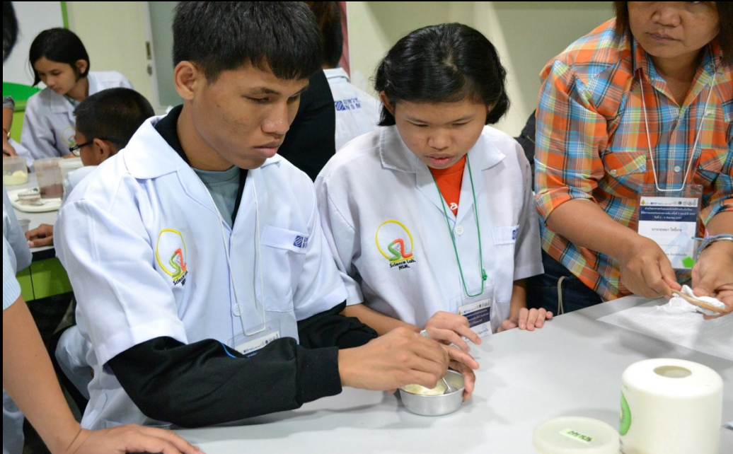
Activity @ Hands-on Laboratory Experiments