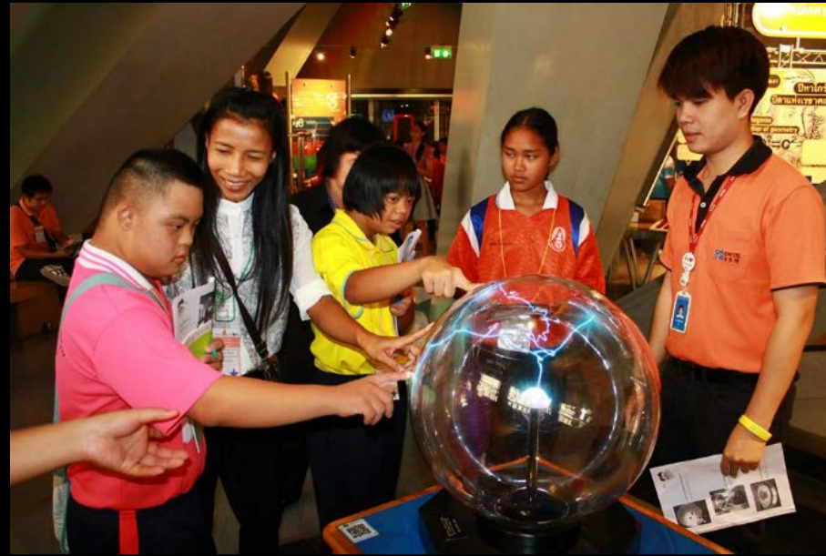
Learning impaired students