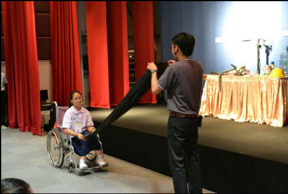
Physically impaired students